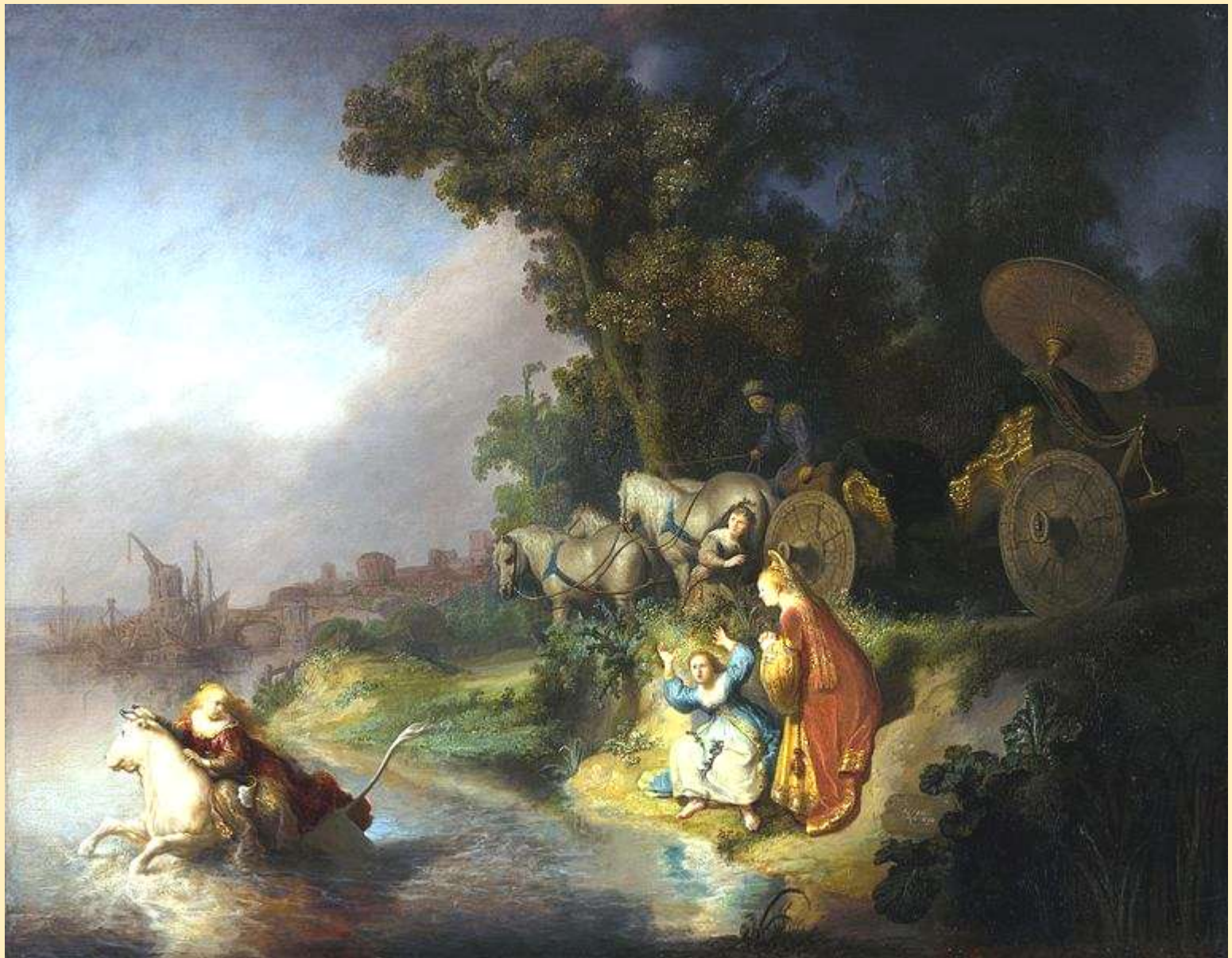
Rembrandt Abduction of Europa, 1632