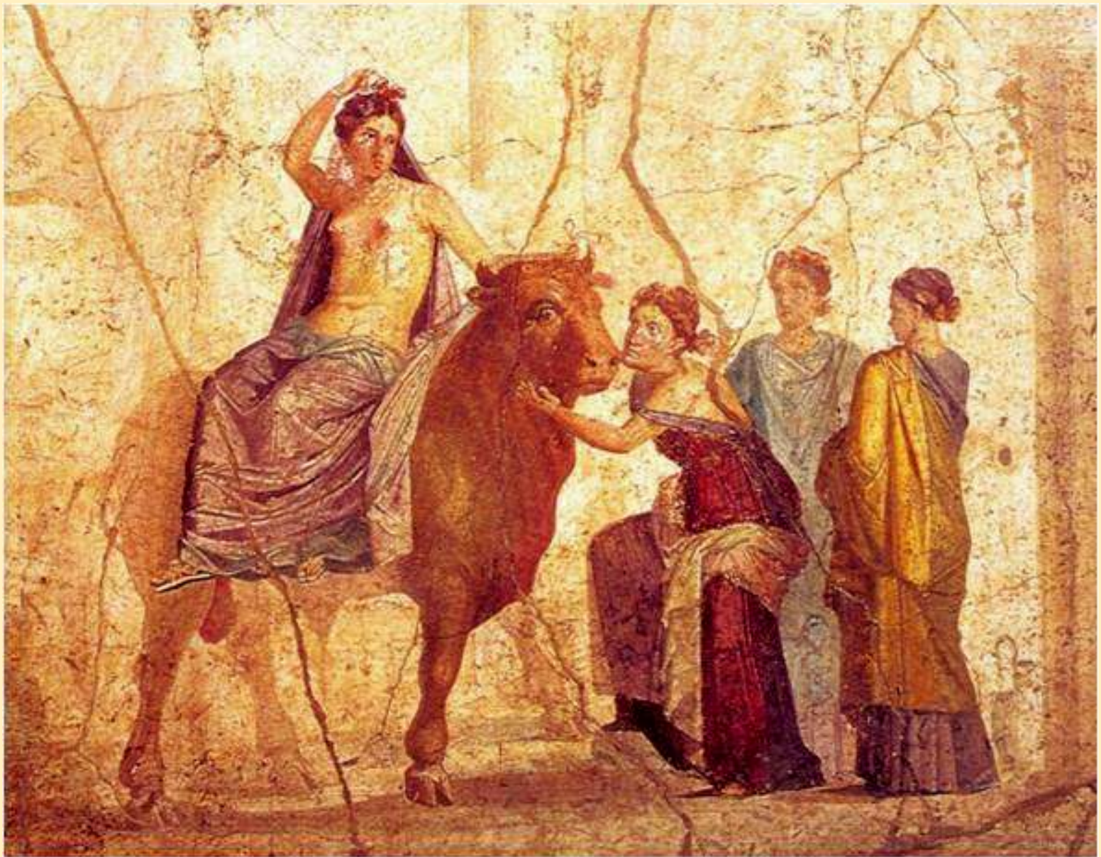
Wall painting from Pompeii, end of 1 st cent. BC. Naples, National Museum