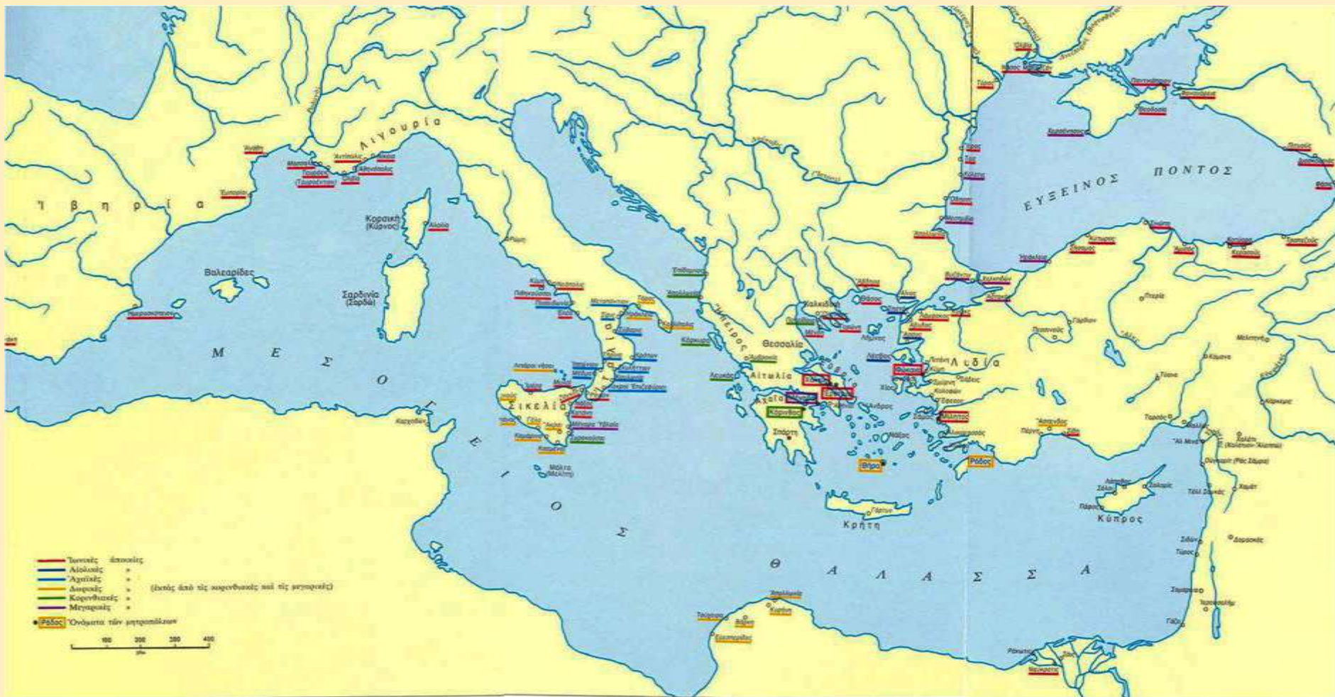
Greek colonies founded from the 8 th through the 6 th century BC.