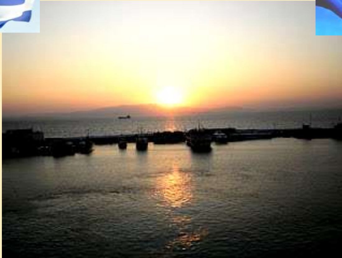
Sunrise in the island of Chios (eastern Aegean Sea)