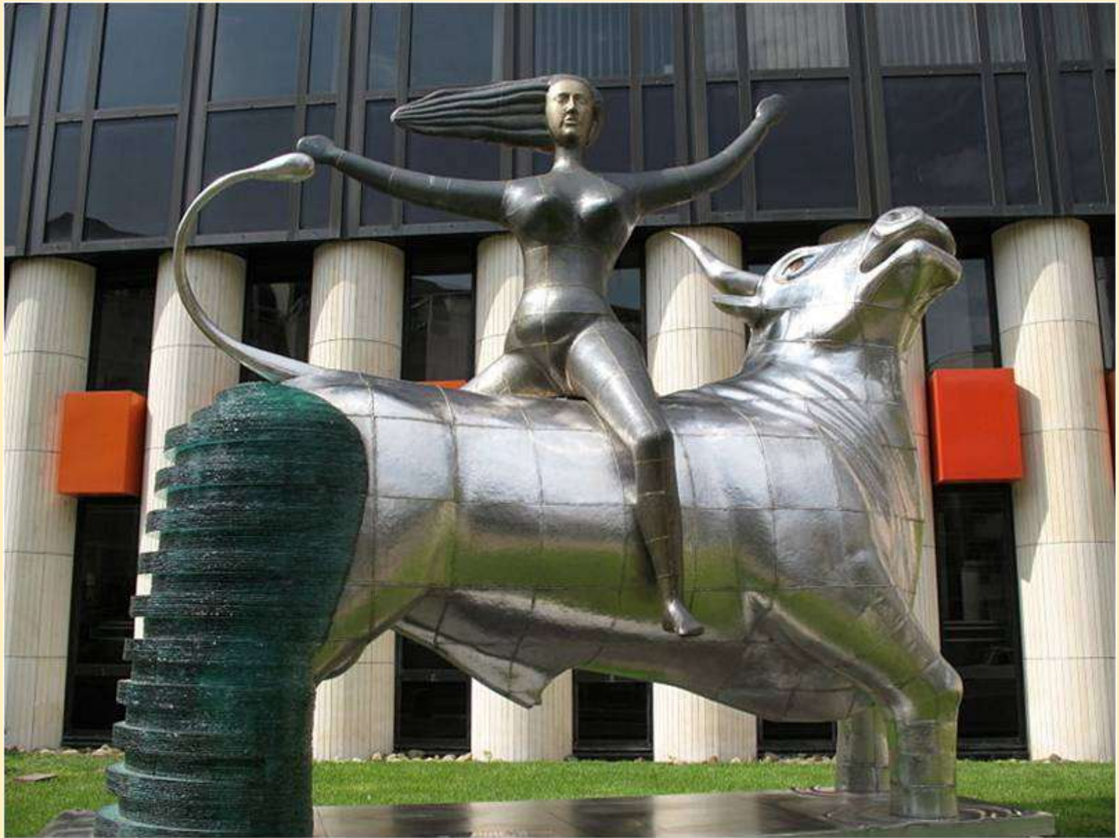
Statue of Europe on the Bull-Zeus in front of the European Parliament, Brussels