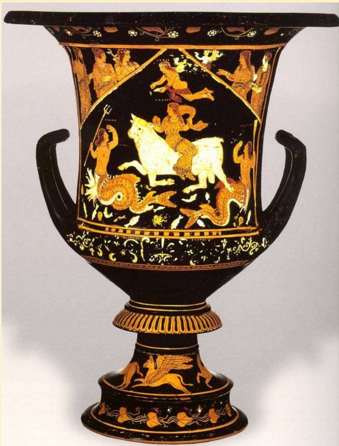
Crater from Paestum (Poseidonia), South Italy, 4 th cent. BC. J.P. Getty Museum, California